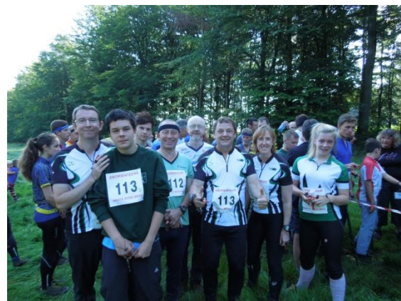
A Group of misfits.